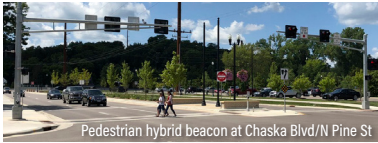
Pedestrian hybrid beacon at Chaska Blvd/N Pine St

The addition of a pedestrian hybrid beacon, like that on Chaska Blvd/N Pine Street, will increase motorist awareness at the existing pedestrian crossing.