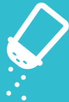
TABLE SALT (NaCl)

REGULAR SALT IS NOT CORROSIVE TO CONCRETE, BUT CAN STILL BE SLIGHTLY DAMAGING. IF NECESSARY, USE ONE OF THE PRODUCTS BELOW SPARINGLY IF SAND AND SHOVELING IS NOT SUFFICIENT: