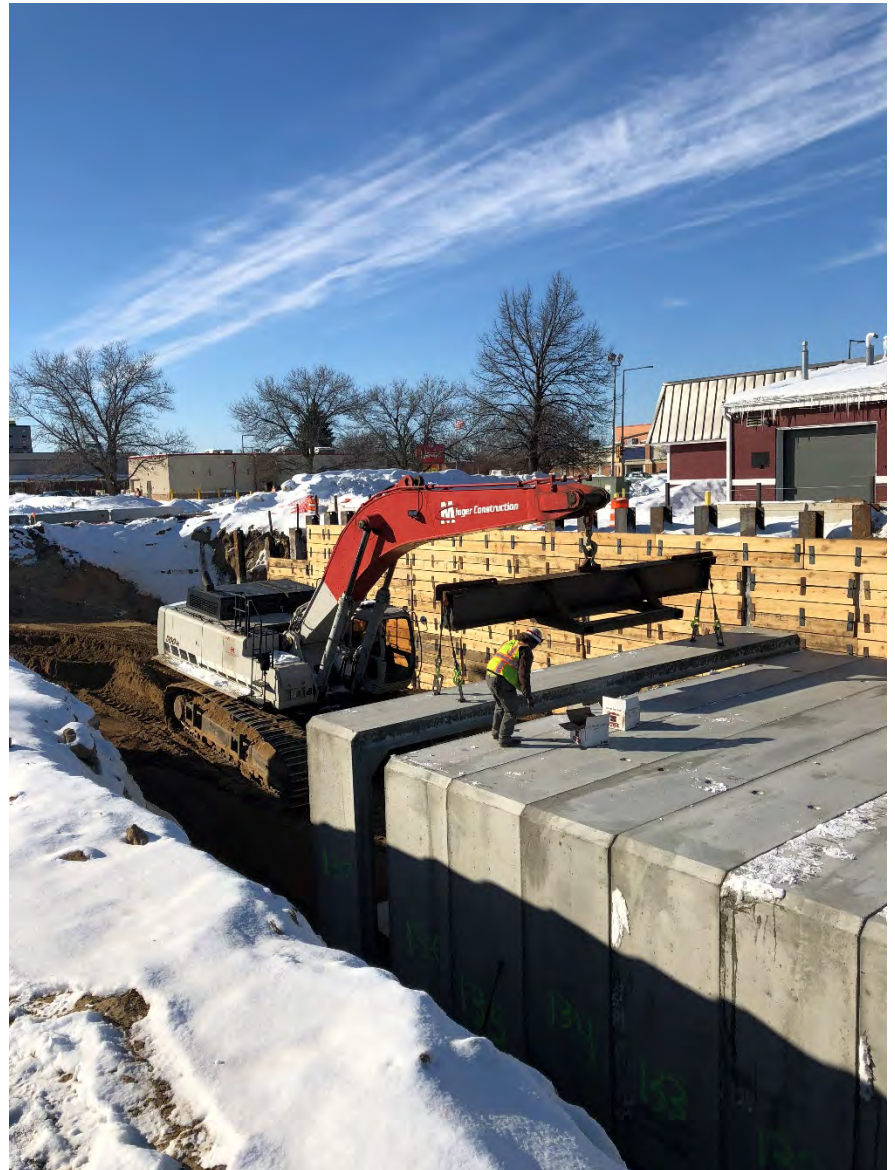
Box culvert installation

Beginning March 11, work will begin on the east half of Morgan Circle. This work includes installing new sanitary and storm sewer, curb, and pavement. The east half of Morgan Circle will be closed during this work, which will take about a month. The west side of Morgan Circle will remain open during this work, but using alternate routes will be easier to access businesses (see access map on page two).