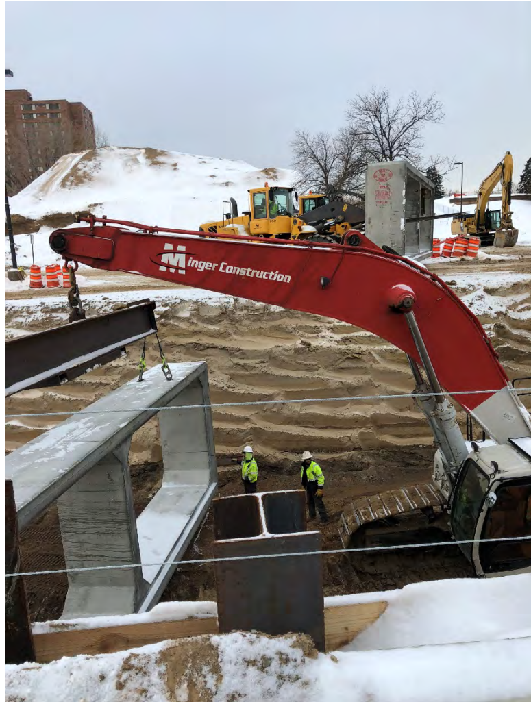
Box culvert installation finished this week.

Storm sewer installation will begin on the east half of Morgan Circle. The east half of Morgan Circle will be closed during this work, which will take about a month. The west side of Morgan Circle will remain open, but using alternate routes will be easier to access businesses (see access map on page two).