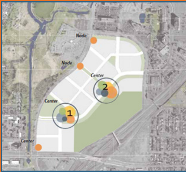
Proposed Commercial/Activity Centers

The emerging vision for the Opportunity Site is focused around strong, mixed-use neighborhoods that offer a range of housing, jobs, and services. An economically strong Opportunity Site will require uses that serve both local and regional needs, are active throughout the day and week, and are compatible with each other. In addition to other uses, the Master Plan proposes commercial/civic activity centers for economic development and employment.