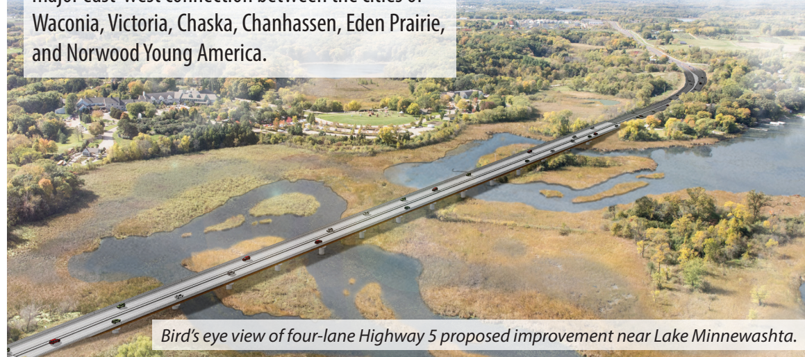
Bird's eye view of four-lane Highway 5 proposed improvement near Lake Minnewashta.

Highway 5 is a regional freight corridor providing a major east-west connection between the cities of Waconia, Victoria, Chaska, Chanhassen, Eden Prairie, and Norwood Young America.