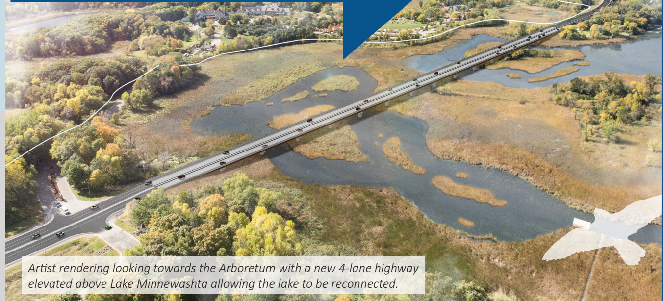
Artist rendering looking towards the Arboretum with a new 4-lane highway elevated above Lake Minnewashta allowing the lake to be reconnected.