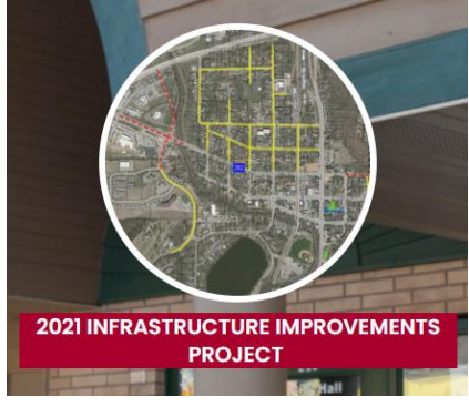
Go to jordanmnengineering.com

and click on the link for "2021 Infrastructure Improvements" for additional information regarding this project. The project website will be updated to include project information and contain resources such as past mailings and answers to frequently asked questions.