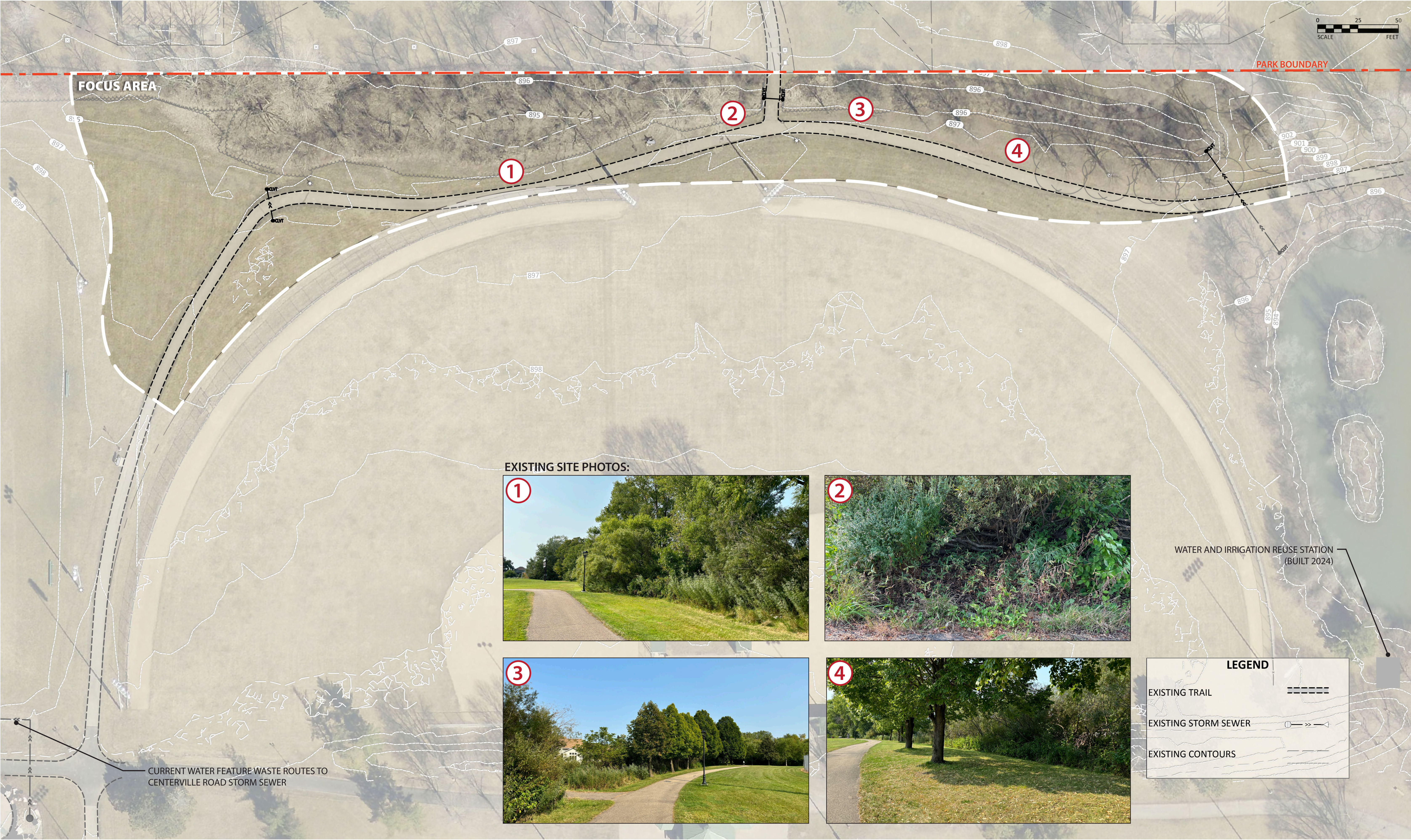
EXISTING SITE PHOTOS: